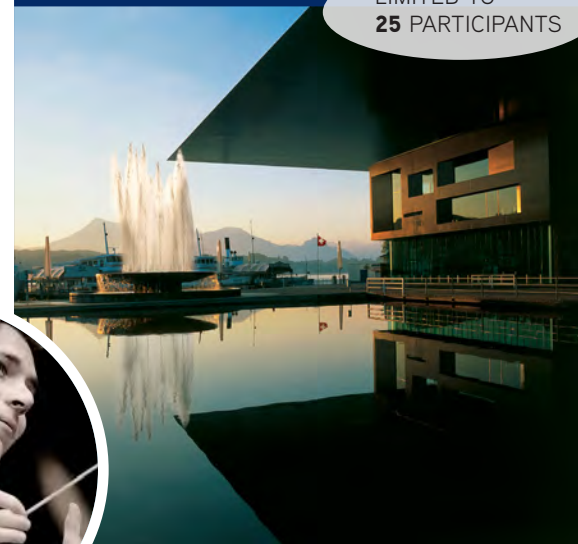
KKL Luzern—home of the Lucerne Festival