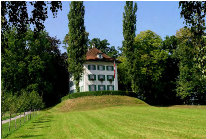
Richard Wagner Museum, Tribschen

Richard Wagner loved Lucerne. After his patron, King Ludwig II, arranged for him to move into a private home, he left the city and lived at Tribschen from 1866–1873, where he hosted many dignitaries including his patron Ludwig, Franz Liszt, and, multiple times, Friedrich Nietzsche. Today we will enjoy a private boat cruise to Wagner's Tribschen where we are accorded a private, pre-public hours tour of the house and a recital on the Master's own piano. Lunch is on the lake in Baumgarten. Our private boat returns to the city and your evening is free.